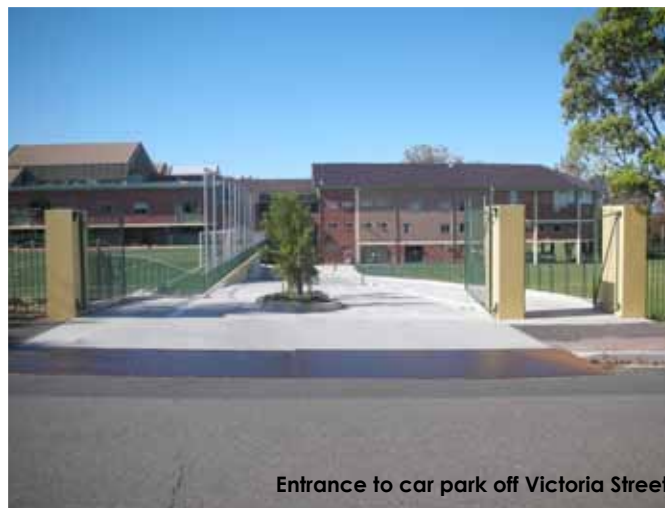
Entrance to car park off Victoria Street

For all emergencies, please contact the Second Master of the Summer Hill Campus on 0420 920 211 or the After Hours Security Guard on 0431 419 828 .