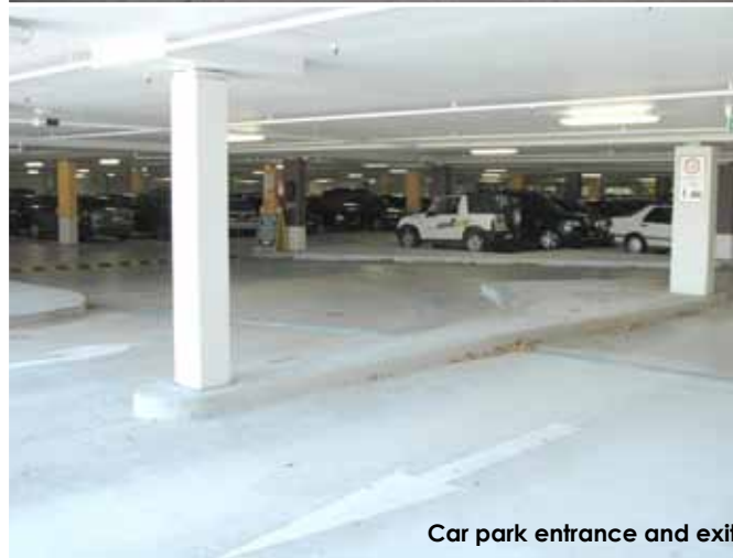
Car park entrance and exit