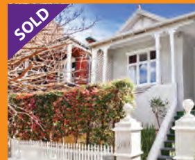
ANNANDALE 280 Johnston Street