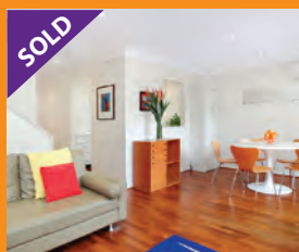
ANNANDALE 142A Nelson Street