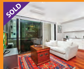
STANMORE 108/23 Corunna Rd