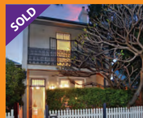
BALMAIN 17 Tuner Street