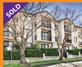
MARRICKVILLE 3/43 Ewart Street