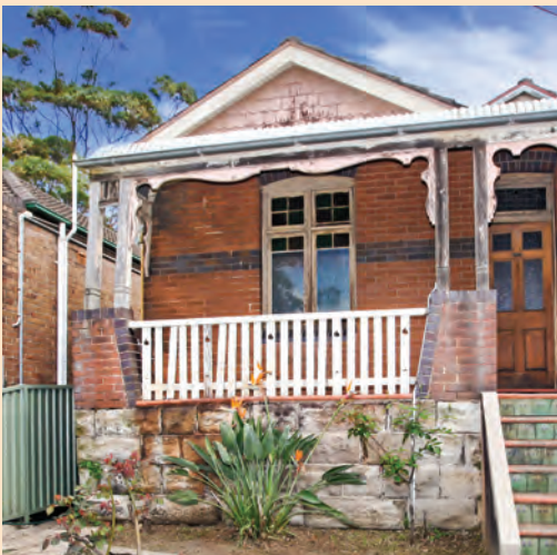
This derelict two-bedroom Annandale house sold for $750,000.

Callagher Estate Agents on site auction of a derelict semi in Annandale last Saturday not only drew heavy bidding but garnered the attention of networks Ten and Seven evening news.