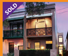
LEICHHARDT 28 Macauley Street