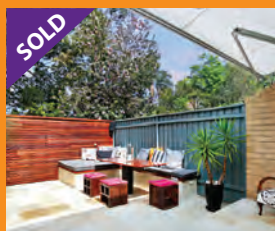
DULWICH HILL 8/55-57 Garnet Street