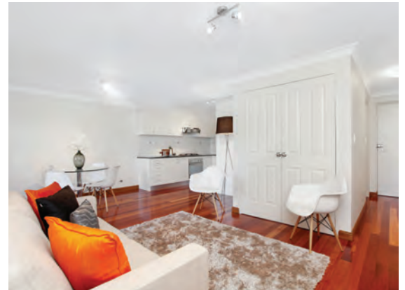
Properties such as this Dulwich Hill one bedroom unit sold in November prior to auction have proved popular with first home buyers since the Government announcement in September.