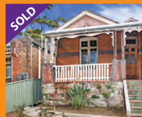
ANNANDALE 11 Bayview Crescent