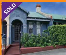
LEICHHARDT 159 Catherine Street