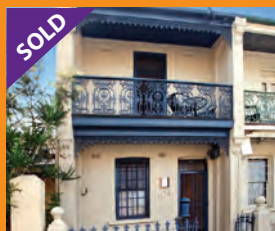
ANNANDALE 104 View Street