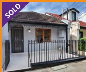
STANMORE 37 Charles Street