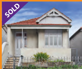
ANNANDALE 94 Booth Street